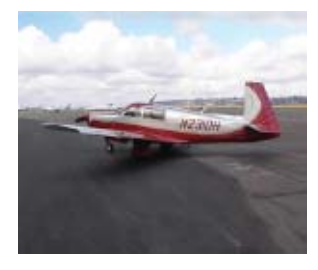
I love airplanes, especially this one!